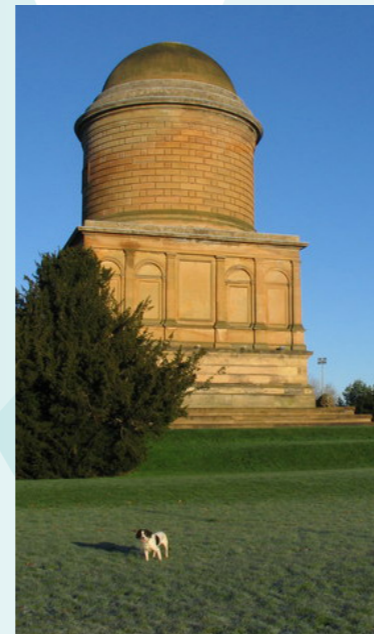
Above: Hamilton Mausoleum

1. Until recently, Hamilton Mausoleum held the record for longest man-made reverberation time. The new world record holder is approximately 150 miles north at the Inchindown Tunnels, Invergordon.